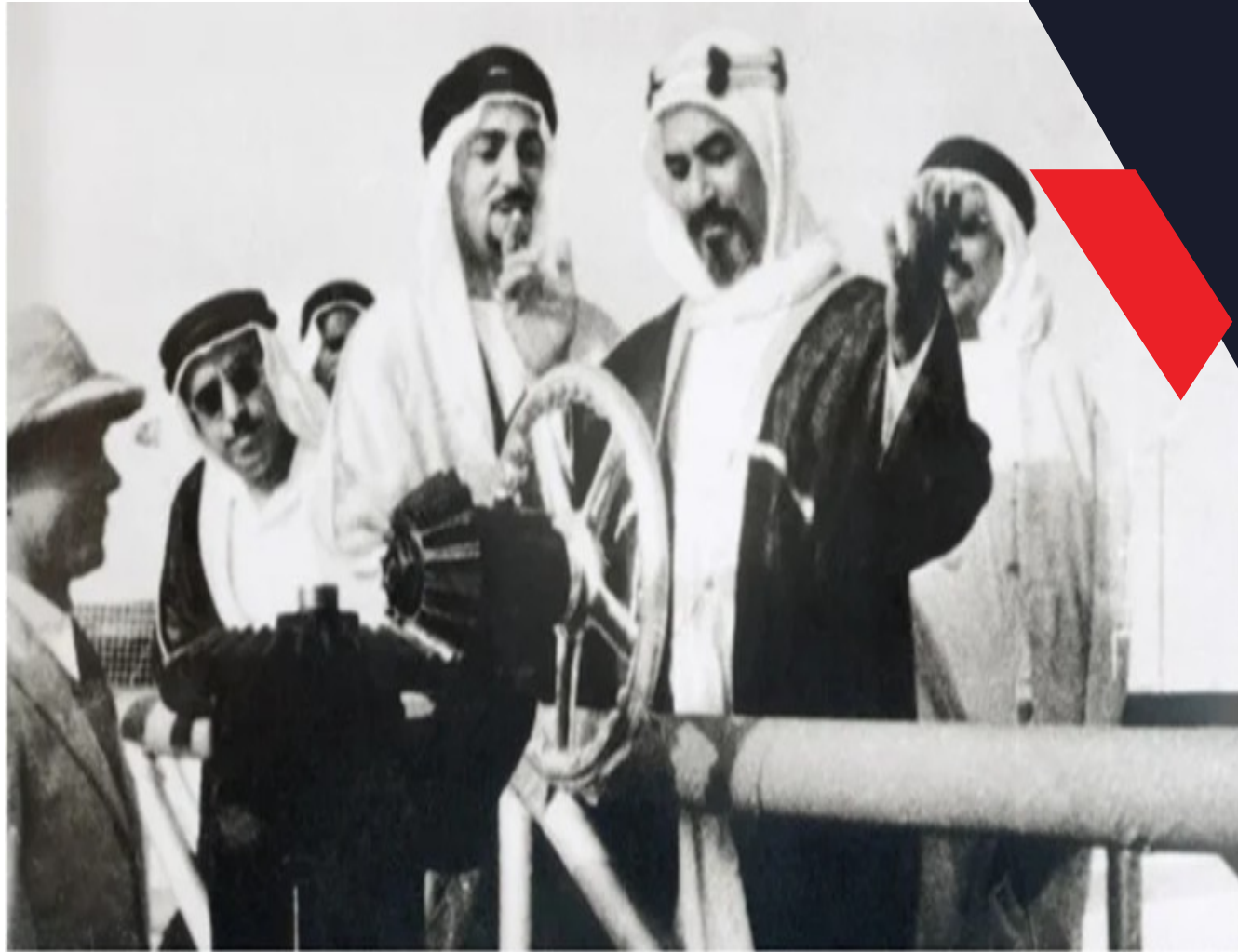
Sheik Ahmed al Jaber Al Sabah opening the silver valve wheel

Through our Associates we also take up Civil & Engineering Construction contracts in the industrial sector of Kuwait.